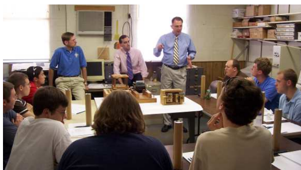
The Tonal Director Gestures