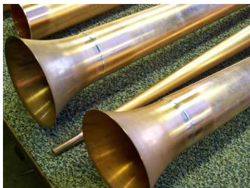
Hauptwerk 8' Trompeta Real Martin Luther College – New Ulm, Minnesota