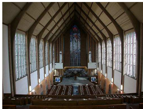
First Baptist Church – Longview, Texas