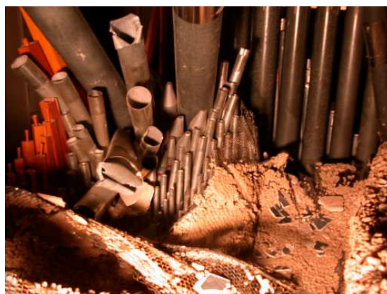
Positiv & Bombarde – Æolian-Skinner, Opus 1174